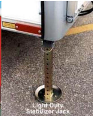
Light Duty Stabilizer Jack