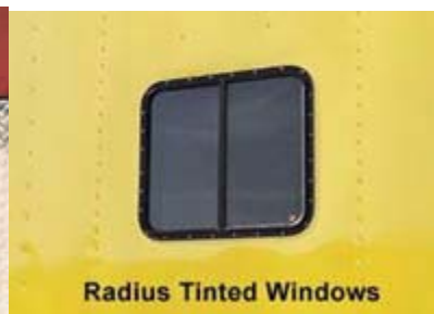
Radius Tinted Windows