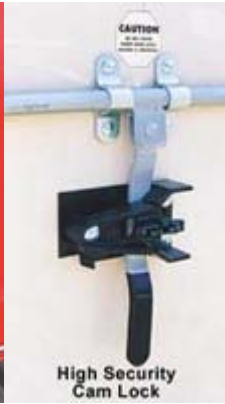
High Security Cam Lock