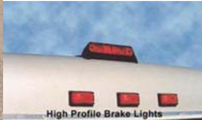
High Profile Brake Lights