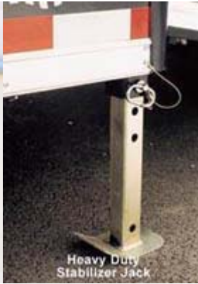
Heavy Duty Stabilizer Jack