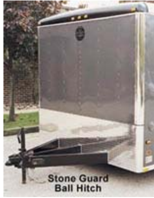
Stone Guard Ball Hitch