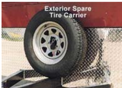
Exterior Spare Tire Carrier