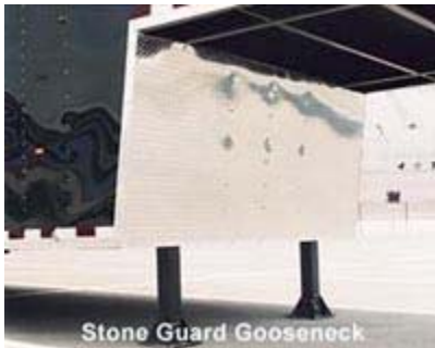
Stone Guard Gooseneck