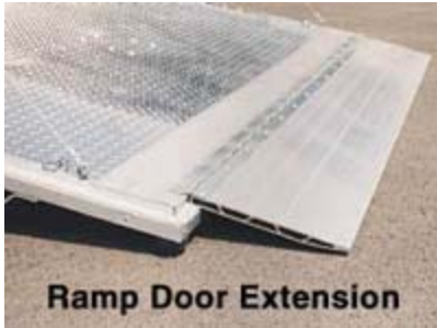
Ramp Door Extension